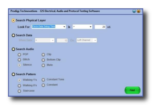
Figure 4: Search options

Penta monitor along with the system utilities such as zoom, pan, un-do, fit to screen, cursors and audio play provides flexibility to the design and debug engineers to identify the problem areas quicker.