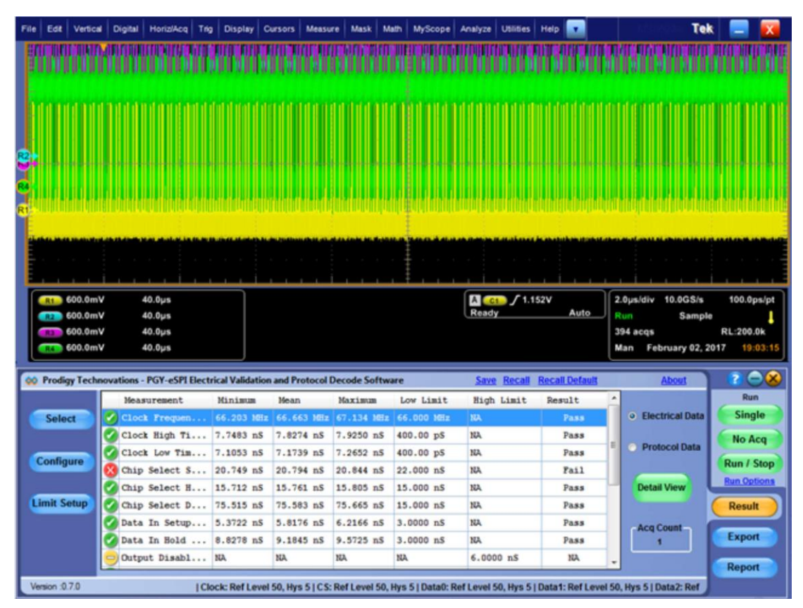
eSPI Electrical Validation & Protocol Decode Software

PGY-eSPI Electrical validation and Protocol decode software runs in Tektronix Oscilloscope provides electrical measurements and protocol decode at click of button. This allows engineers quickly check for eSPI compliance and flexibility to debug the failure. In addistion to this engineer can decode the command and response of eSPI debug the communication. PGY-eSPI takes advantage of digital channels of MSO and provides the decoding of eSPI datalines.